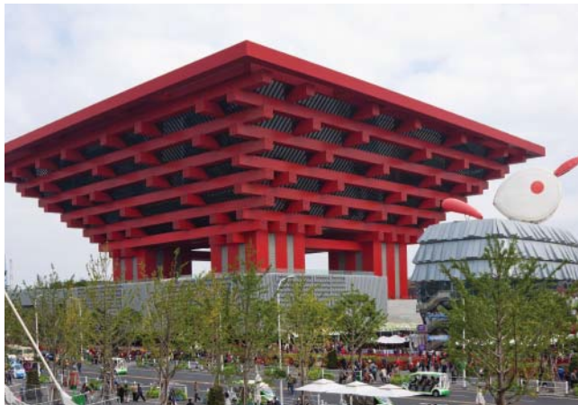
As part of the Shanghai Expo 2010, the US EPA and the Shanghai Environmental Protection Bureau (EPB) launched AIRNow International, with real-time air quality data reporting from the World Expo site.

within a tightly structured hierarchy building new relationships and understandings along the way.